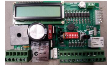
Replace Sliding or swing single motor board