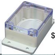
Water proof box